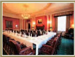
The 'Smoking' Room