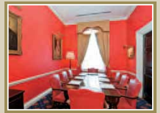
The Morrison Room