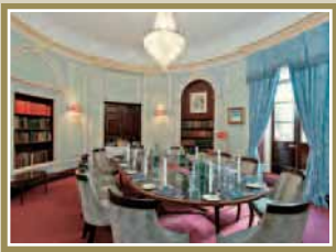
The Oval Room & Terrace